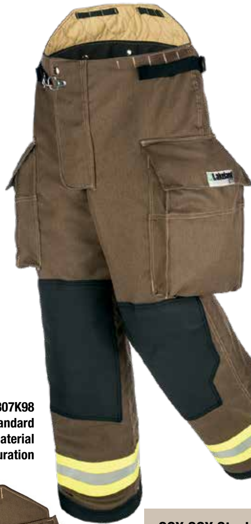
Style OSX BA3307K98 shown in Standard OSX B1 Material Configuration